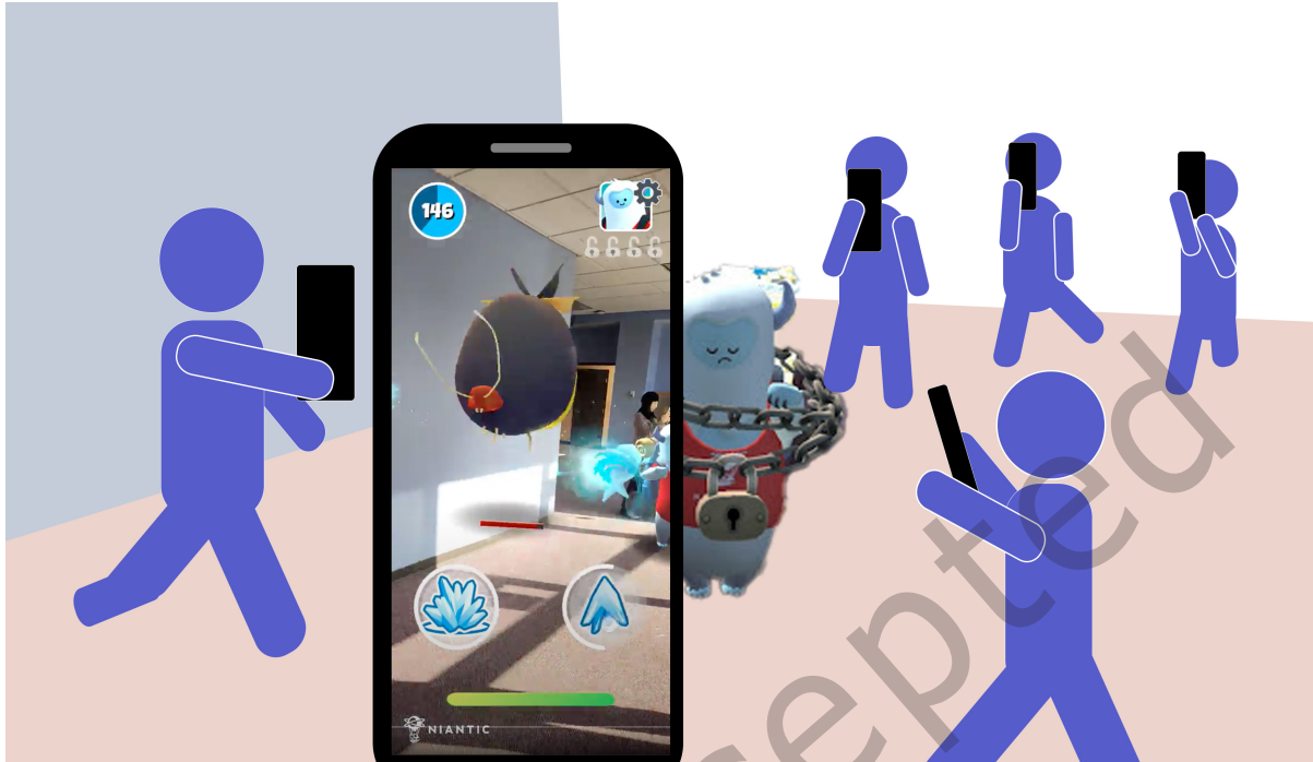
Fig. 2. An illustration of six users playing Urban Legends together. They are holding their mobile phones, viewing and aiming at AR components, clicking buttons on phone screens, and moving in the space. They have to defeat AR enemies and save Yeti collaboratively.

sessions and conducted interviews afterward. To maximize the depth and breadth of insights, we employed both focus groups and one-on-one interviews. Focus groups held immediately after in-person gameplay sessions helped capture shared perspectives through group discussions, while one-on-one interviews provided a deeper exploration of individual experiences and perceptions.