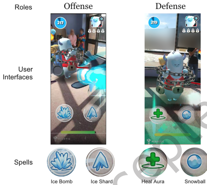
Fig. 4. User Interfaces of Offense and Defense. Users can tap the round icons to launch spells. Each role has two spells. Screenshots from participants' screen recordings.

around or adjust their phone angles. This approach allowed us to observe how participants naturally discovered and adapted to the game's interaction affordances. Then we went to the corridor, which had enough space for the game sessions (note that every group played at the same place).